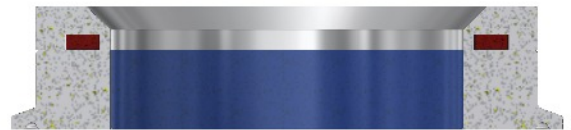
Fuseview™ with heater